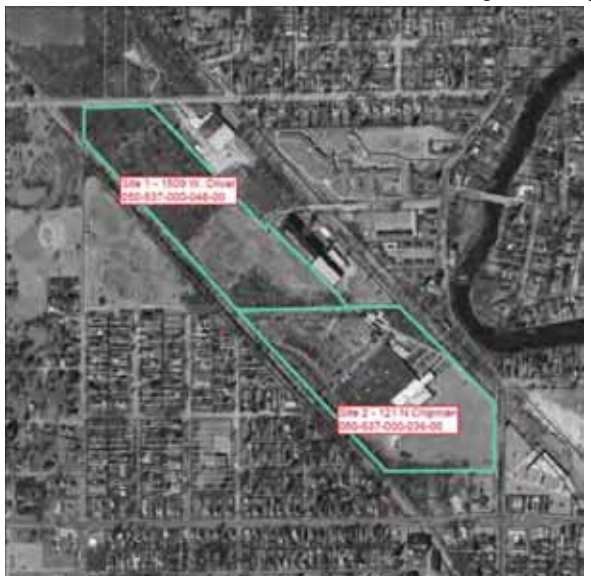
APPENDIX B – Project Map, Road Map & Water Main Map