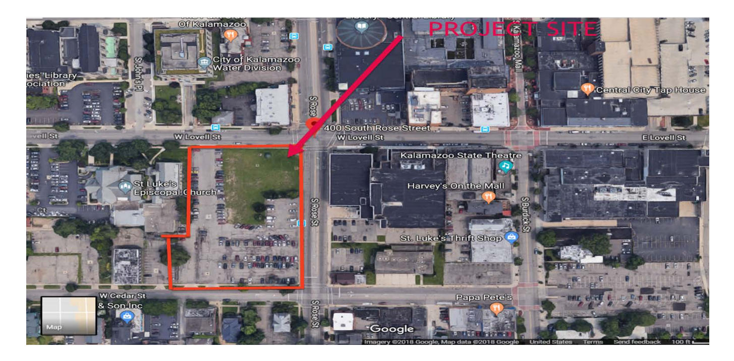
APPENDIX C – Project Map and Renderings