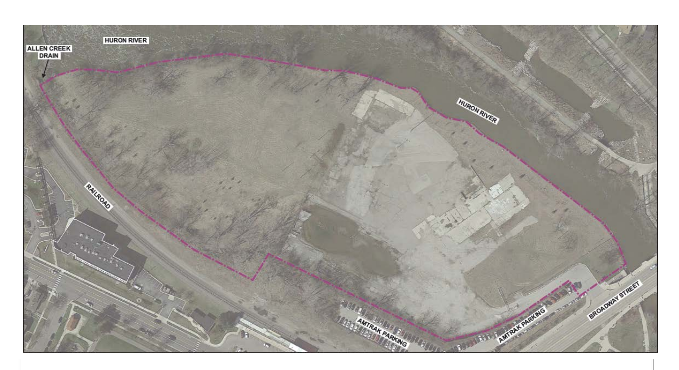
APPENDIX A – Project Map and Renderings