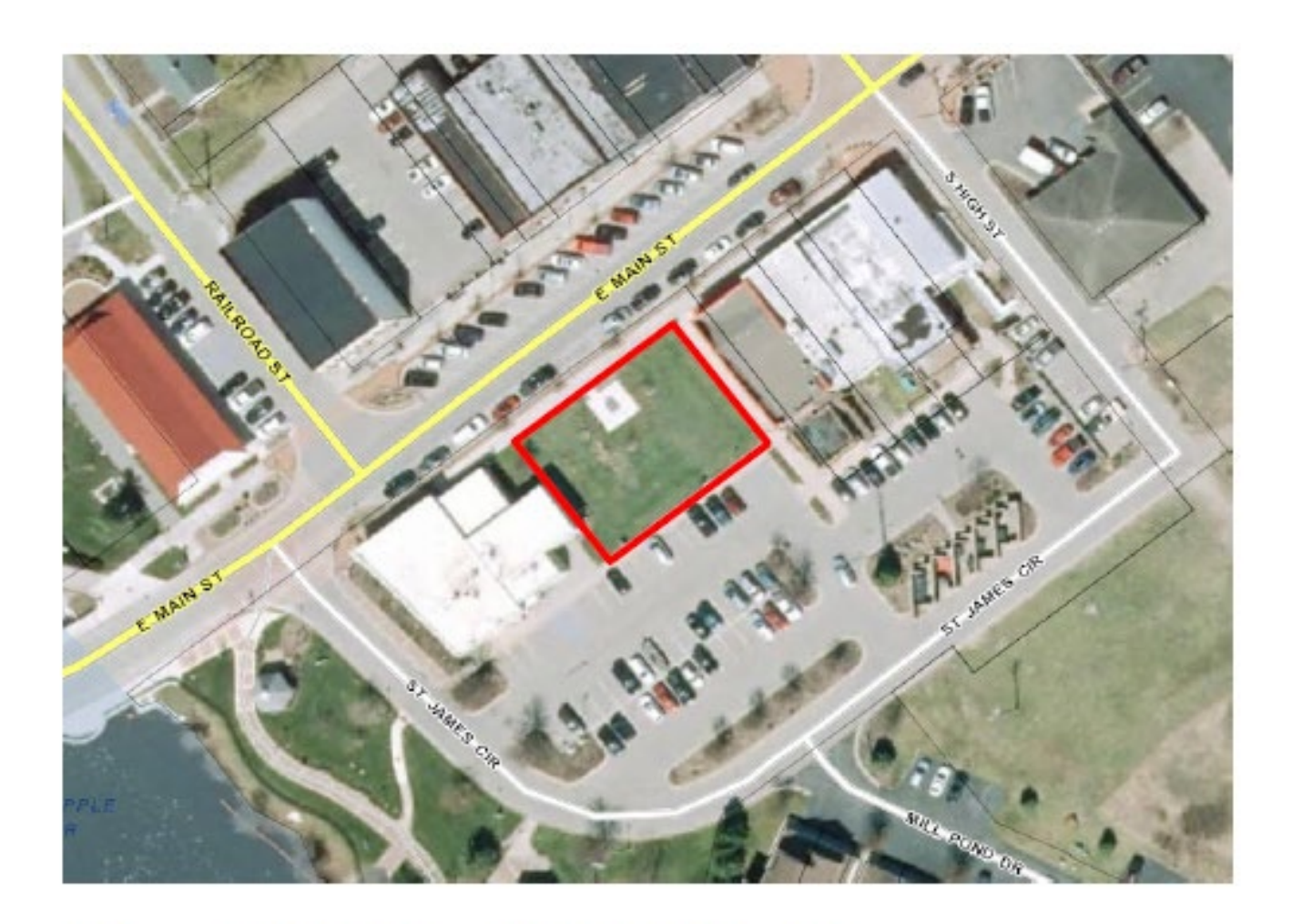
Address: 112 East Main Street, Middleville, Michigan 49333