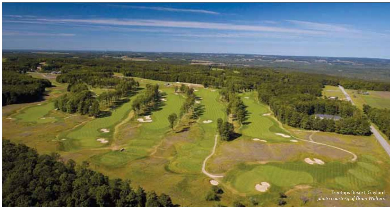
Treetops Resort, Gaylord