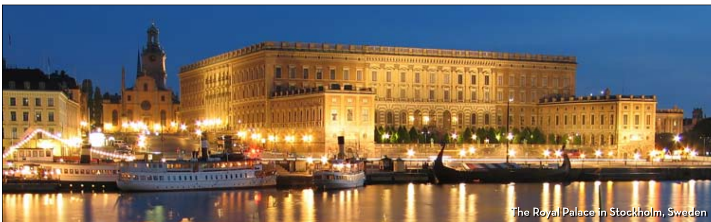
The Royal Palace in Stockholm, Sweden

Sweden is recognized as a world-leader in alternative energy development. The country has established the ambitious goal of being completely oil-free by 2020. Granholm's Centers of Energy Excellence (COEE) program grew out of her visit last year to Sweden.